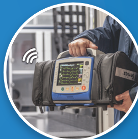
RFID EQUIPMENT TRACKING