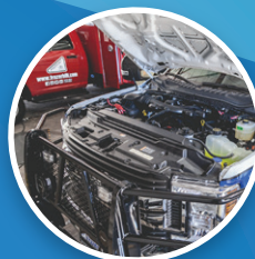
SMART ENGINE IDLING